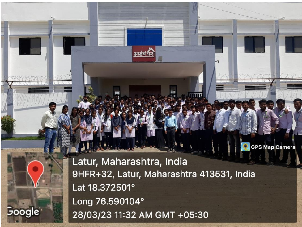
SANT GADGEBABA CHILDREN ORPHANAGE, LATUR